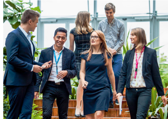
Nestlé with other partnering companies have offered young people over 95 000 jobs and training opportunities since 2014.