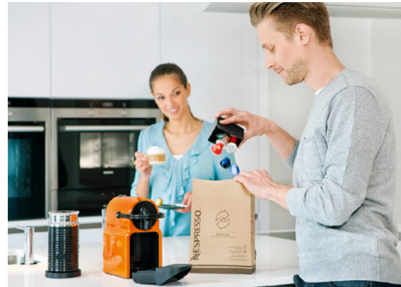
Nespresso continues to extend its global recycling scheme and invested CHF 25 million in 2017.