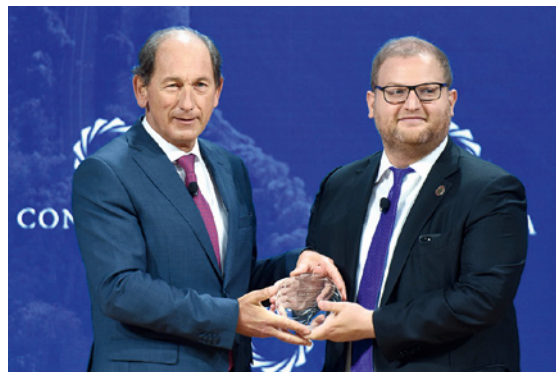
New York, 18 September 2017 – Nestlé Chairman, Paul Bulcke, receives the Concordia Leadership Award 2017 for leading the company's ongoing commitment to CSV and supporting the UN Sustainable Development Goals.

Engaging others on important issues lies at the heart of how we do business. We seek the advice of experts and advocates to develop our