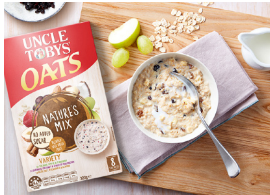
Uncle Tobys, Australia's leading brand of oats, has launched Nature's Mix , a no-added sugar range that is naturally sweetened with dried fruit and nuts.

Inspired by our founder, Henri Nestlé, and with nutrition at our core, we work closely with partners to offer foods and beverages that enable healthier and happier lives. We have set commitments and objectives to make our portfolio even healthier and tastier, inspire consumers to lead healthier lives, and develop and share our understanding of the connection between nutrition and health.