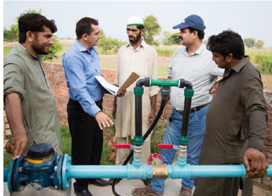
The Nestlé Pakistan water plan was unveiled in October 2017, in collaboration with Lahore University of Management Sciences and WWF. It promotes water resources conservation, introduces sustainable agricultural techniques, and provides access to clean and safe water.

We are working, with partners and stakeholders, towards our ambition to strive for zero environmental impact in our operations. We have set clear commitments and objectives to use sustainably-managed and renewable resources, operate more efficiently, aim for zero waste for disposal and improve water management. We also continue to participate actively in initiatives that reduce food loss and waste, and that preserve our forests, oceans and biodiversity.