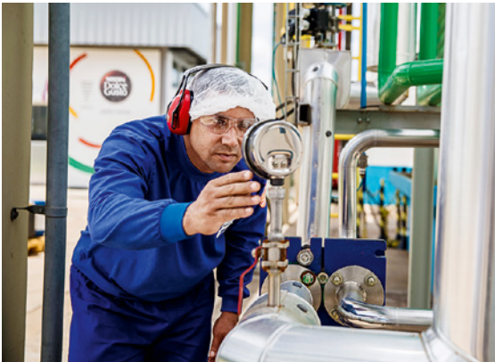
Our Nescafé Dolce Gusto factory in Montes Claros, Brazil, achieved a triple-zero milestone: zero water withdrawal, zero waste for disposal and zero net GHG emissions.