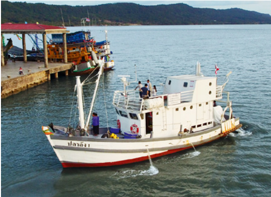
Responsible sourcing in pet food: in partnership with the Thai Government and a supplier, we have developed a showcase vessel. It is used in trainings to address labour rights abuses in the seafood industry.